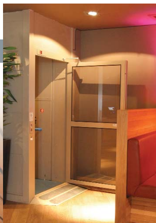
A Stannah Midilift provides access to the bar on the mezzanine level.