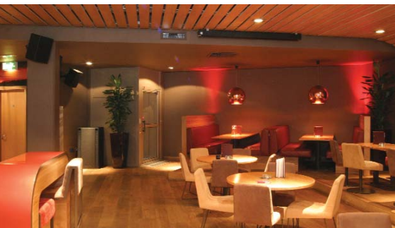
Below, clockwise from the left: The bar and seating area on the mezzanine level; A Stannah Midilift provides access from the deli to the mezzanine level; The Midilift in the New York style deli on street level, where customers are first treated to the Tonic experience.