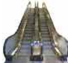
Escalators and Moving Walkways