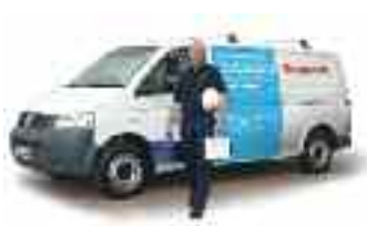
Lift Service and Repair