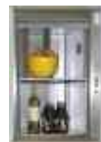
Service and Goods Lifts