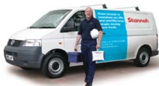
Lift Service and Repair