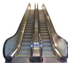
Escalators and Moving Walkways