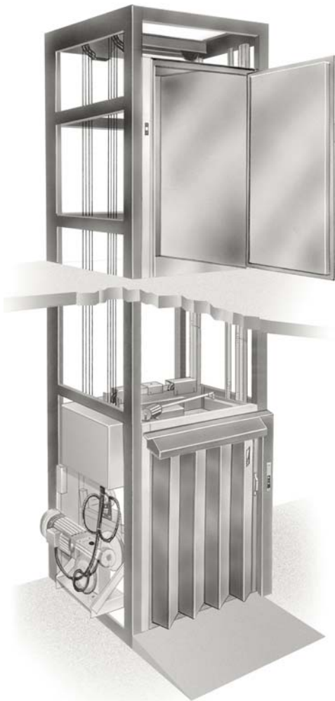
Above: upper landing – single hinged steel door; lower landing – optional concertina shutter leaf gate