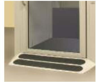
Fixed ground floor ramp