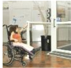
Stanchion operating panel