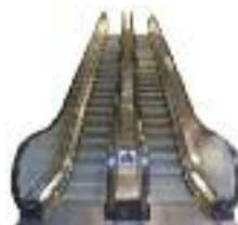
Escalators and Moving Walkways