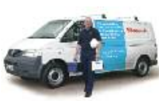
Lift Service and Repair