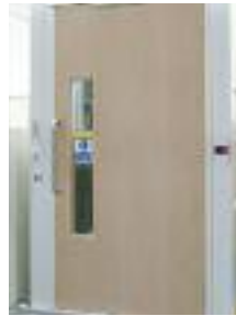
Fire rated landing doors