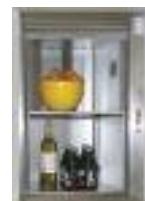
Goods and Service Lifts