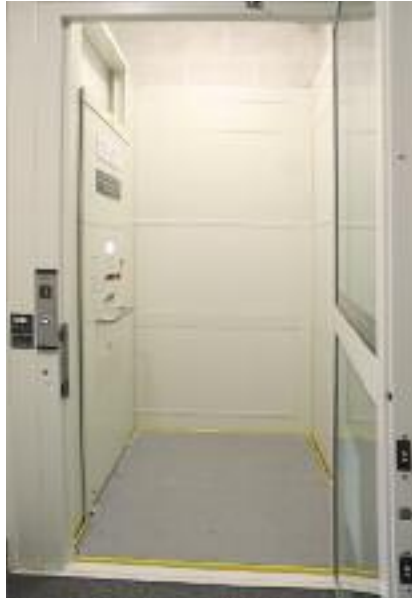
Midilift SL supplied in RAL 9002 (grey white) powder coated finish as standard