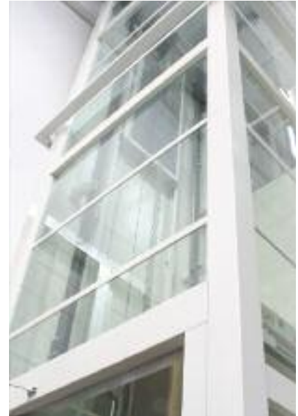
The Midilift structure-supported enclosure shown with optional glass infill panels