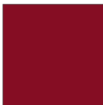
Burgundy RAL 3005