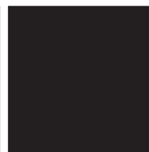
Jet Black RAL 9005