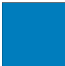
Sky Blue RAL 5015