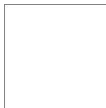
Ultra White RAL 9016