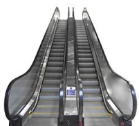
Escalators and moving walkways

Stannah stairlifts are as stylish as they are practical. Since 1975 over 400,000 units have been sold worldwide, making Stannah global market leaders in stairlifts.