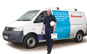
Lift refurbishments, service and repair