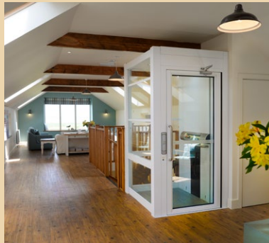
...or more traditional

The Midilift range offers an array of configurations for you to find your perfect fit. Choose from a range of platform sizes or opt for a cabin, giving the look and feel of a passenger lift.