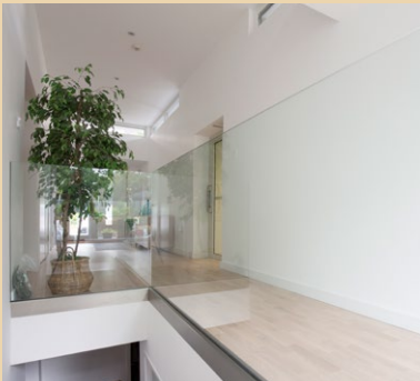
Discreetly fits into any environment, whether modern...