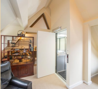
Easy access to all floors in your home