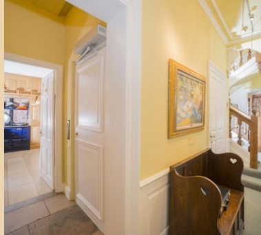
Fully customisable to blend into its surroundings