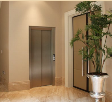
...and is discreet when not in use