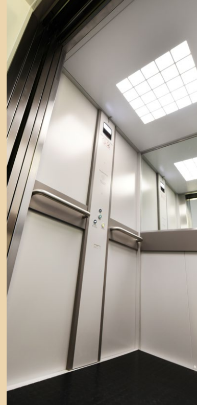
Plenty of space inside for up to 5 people