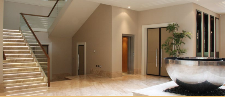
The Piccolo makes a smart, practical addition in your home...